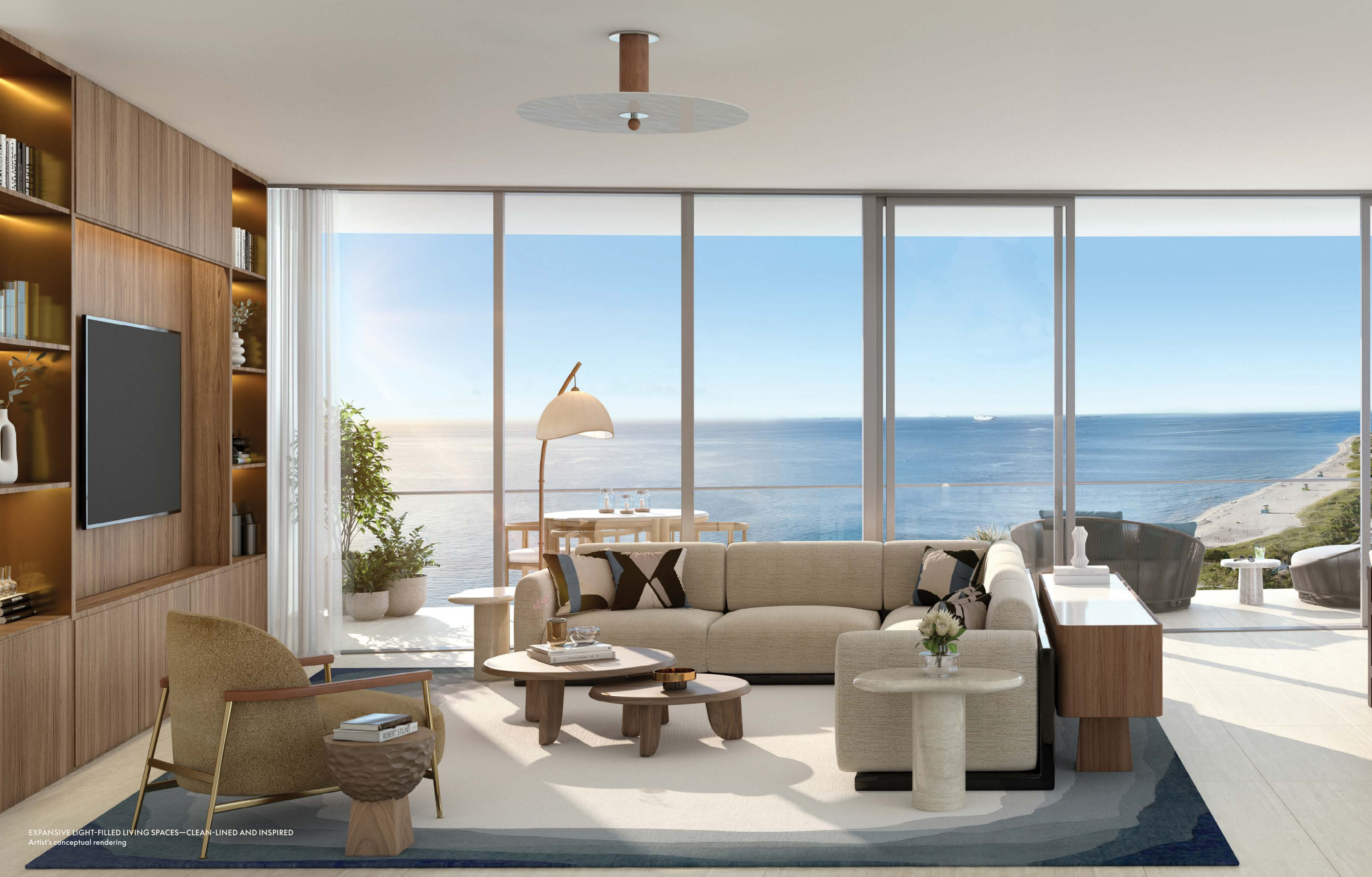
EXPANSIVE LIGHT-FILLED LIVING SPACES—CLEAN-LINED AND INSPIRED Artist's conceptual rendering