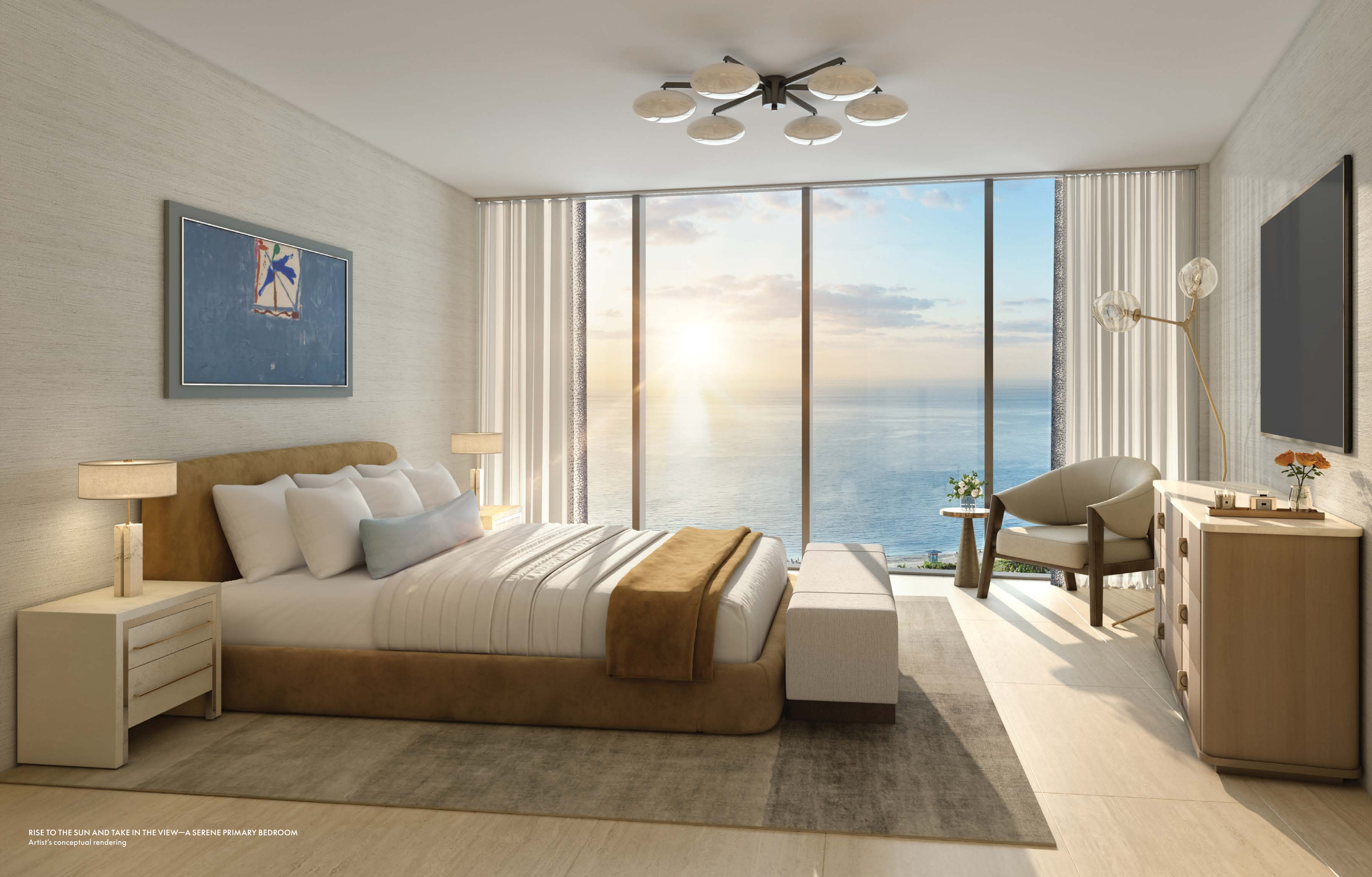
RISE TO THE SUN AND TAKE IN THE VIEW—A SERENE PRIMARY BEDROOM Artist's conceptual rendering