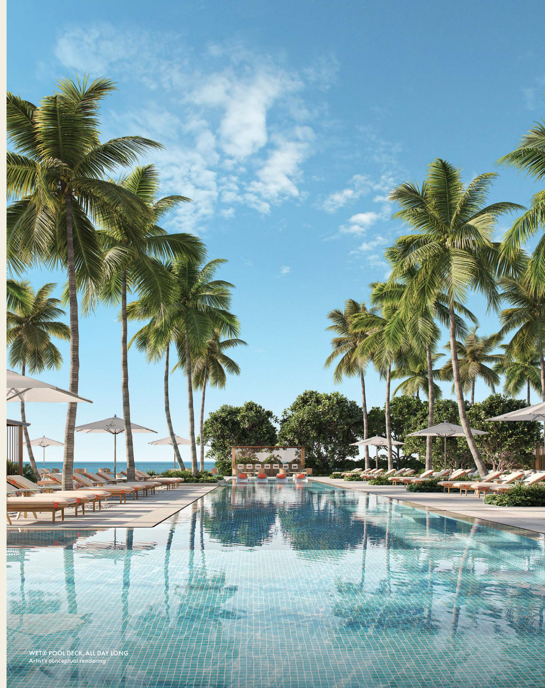
WET® POOL DECK, ALL DAY LONG Artist's conceptual rendering

Game lounge with F1 racing and world-class multisport simulator