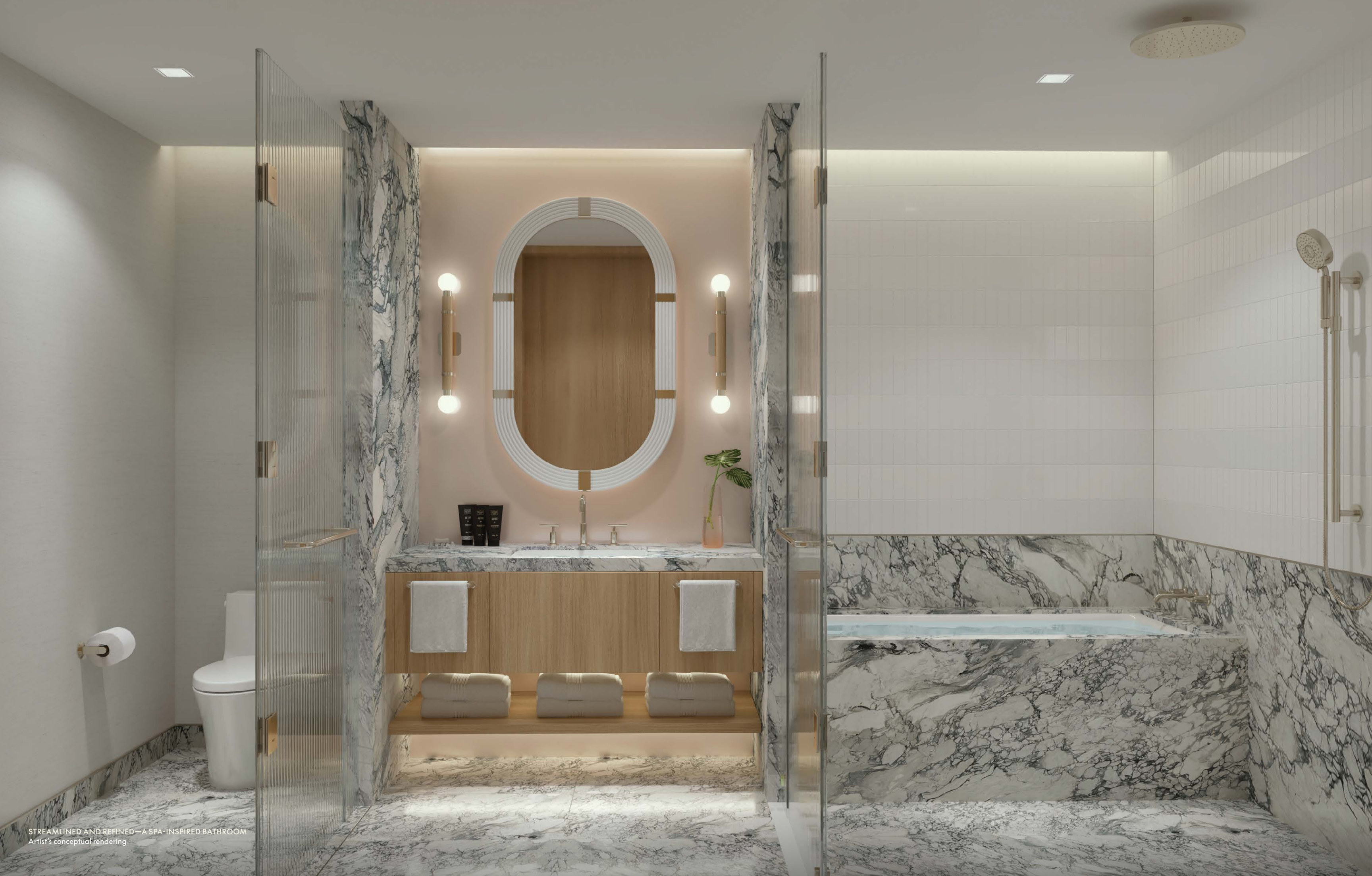
STREAMLINED AND REFINED—A SPA-INSPIRED BATHROOM Artist's conceptual rendering