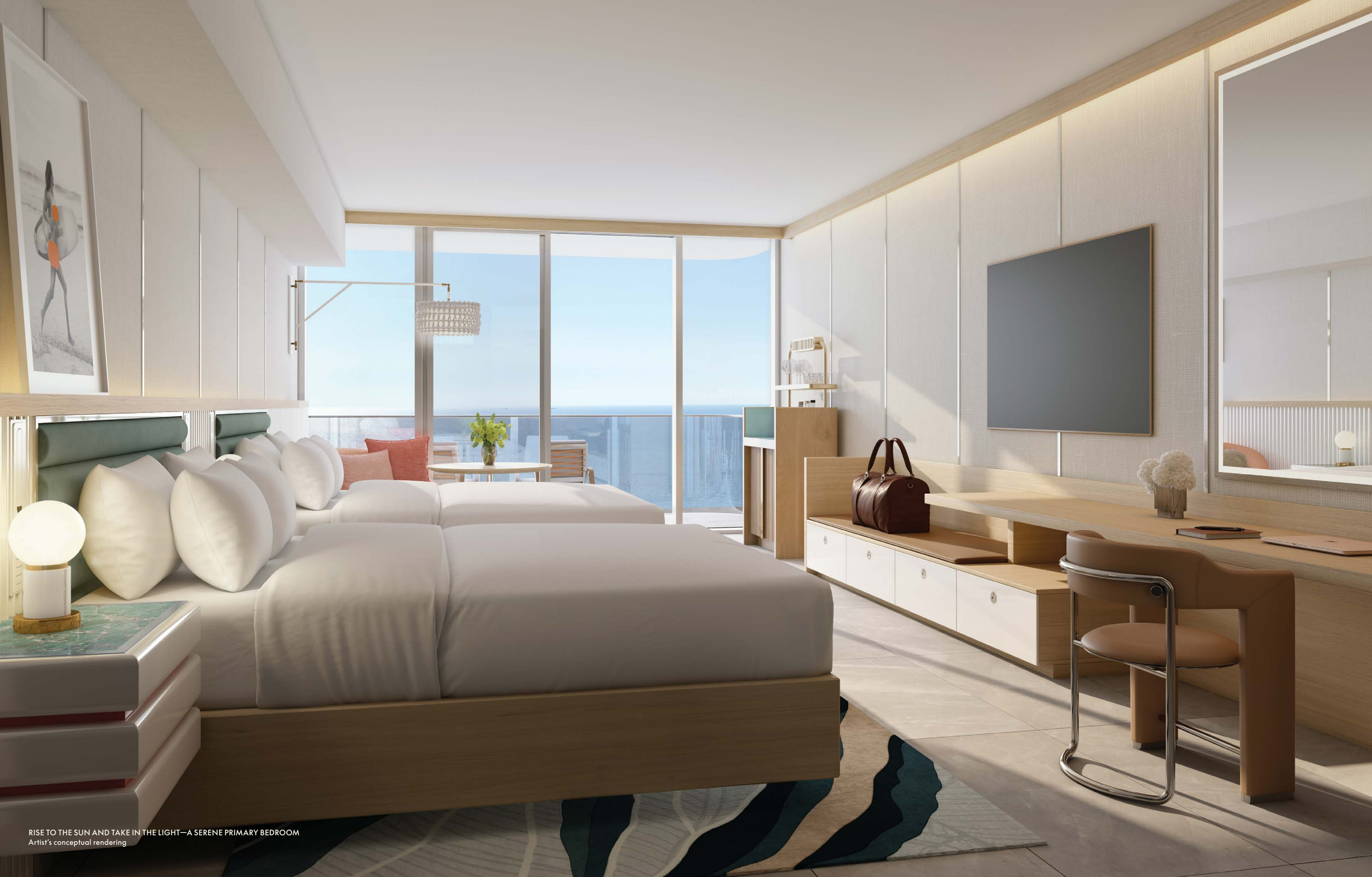
RISE TO THE SUN AND TAKE IN THE LIGHT—A SERENE PRIMARY BEDROOM Artist's conceptual rendering