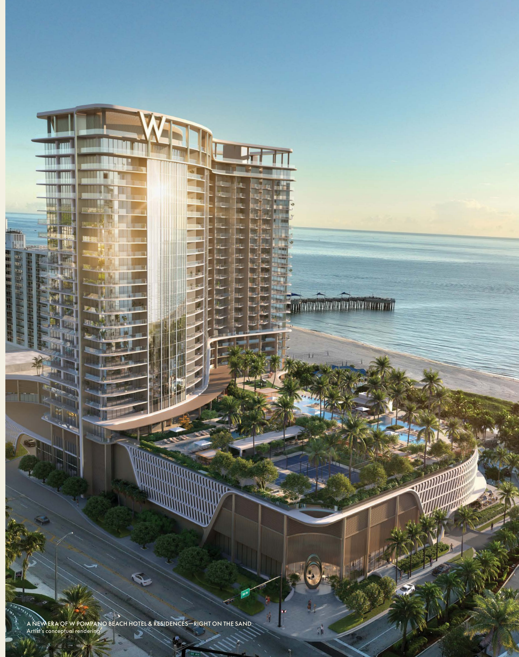
A NEW ERA OF W POMPAÑO BEACH HOTEL & RESIDENCES—RIGHT ON THE SAND Artist's conceptual rendering

*Some of the foregoing may be offered for an added cost.